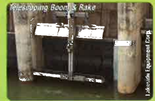
Telescoping Boom & Rake