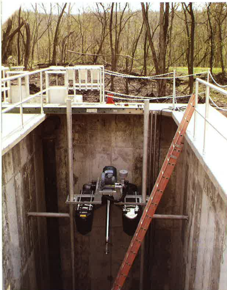
This pre-start up photo shows how the unit is able to ride vertically up and down on stainless steel slide-pole assemblies as water levels in the tank change.

fill and anoxic mix where the mixer-only portion of the aerator is in operation, 120 minutes of fill and aeration where the full aerator/mixer is in operation, 45 minutes of settling with the aerator/mixer in standby, and 60 minutes of decant with the aerator/mixer in standby and the decanter in operation. Total, there are six cycles per day.