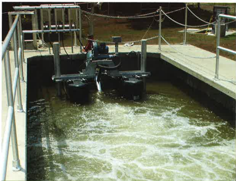
The Triton dual-function aerator/mixer provides process flexibility to nitrify and denitrify as well as facilitate biological phosphorus removal by changing controls to allow for anoxic mixing steps during the cycles.

The aerators are not self-aspirating. All of the air